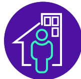
Administration/ Domiciliation services