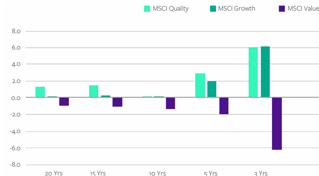
Fig 2: Quality is more resilient in down markets

MSCI Indices, cumulative net daily total returns, USD: 2000 to 2021