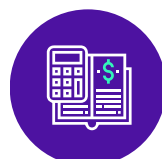
Accounting / Bookkeeping